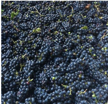
Perfectly ripe, high quality.