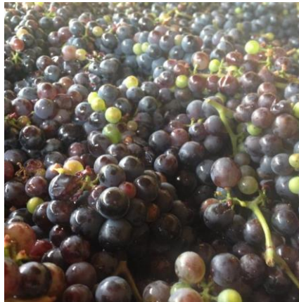
Completely unripe. Low end.