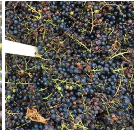
Unacceptable quality. Rejected.